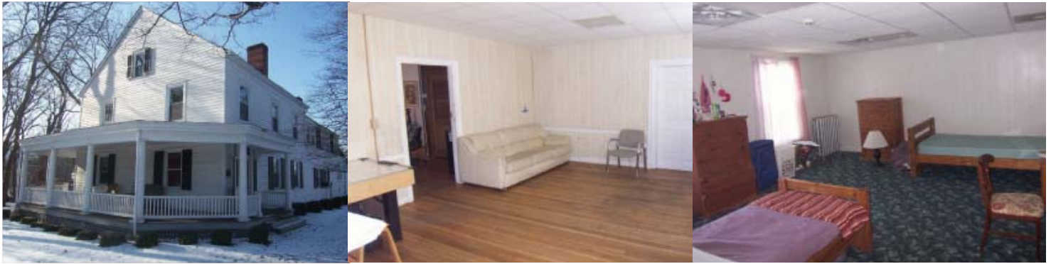
Above is the Girls' Home in Cornwall